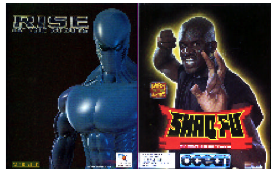
Battle a future technology in "Rise" or with a current superstar in "Shaq-Fu".

repel the alien forces. Experience 30 levels of action, 256 color graphics and 12 channel music. Included are four spectacular tunnel sequences, hordes of 3-D ray-traced enemies, underwater missions and two special secret missions.